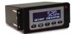
Desktop Panel Mount