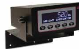
Desktop Wall Mount