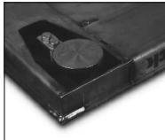
The load cells are recessed within the channel and protected on all sides. SUREFOOT supports provide a superior load introduction surface, reducing extraneous forces which might affect scale accuracy.