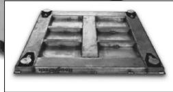
The 6" stainless steel channels provide superior protection for load cells and cable.