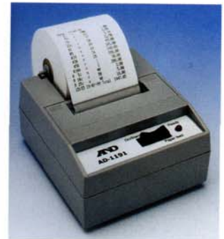
AD-1191 Dot Matrix Compact Printer